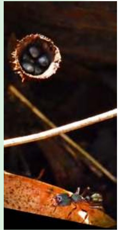
Birds Nest Fungi in the 'Garden for Wildlife' in front of Barung Resource Centre

Footnote: Gretchen Evans has been Barung's "fungi correspondent" for many years but is now taking a well-earned break. Thankyou, Gretchen – you've left big shoes to fill!