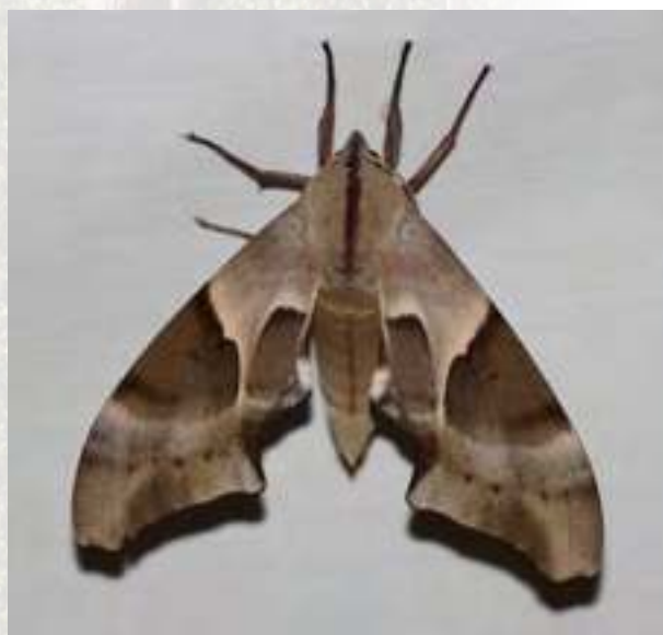
Triangle Hawk Moth Coequosa australasiae

See what you can find in your garden and send in a photo of any interesting finds!