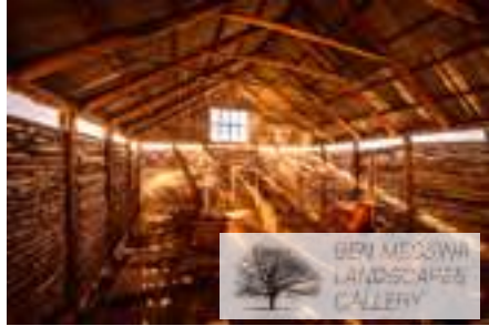
BEN MESSINA LANDSCAPES GALLERY