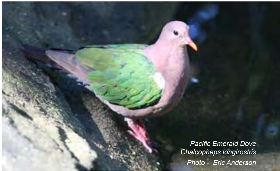
Pacific Emerald Dove Chalcophaps longirostris

Emerald Doves generally nest at any time of the year with a peak of breeding in spring and early summer. The nest is a typical flimsy platform of twigs placed in vines, tree limb or fork, or dense vegetation. Two creamy eggs form the usual clutch and incubation lasts 14-16 days. The parents share incubation duties, with the cock usually incubating during the day and the hen at night. Fledging occurs as early as 12-13 days old but some may remain in the nest for up to 3 weeks.