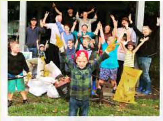
The Clean up the Obi crew on Clean up Australia Day