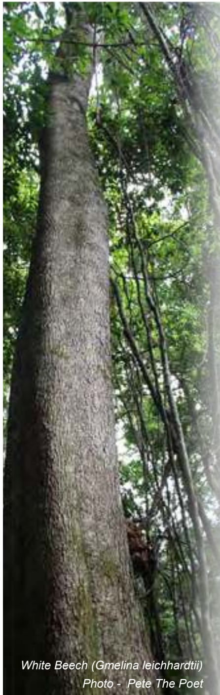
White Beech (Gmelina leichhardtii)