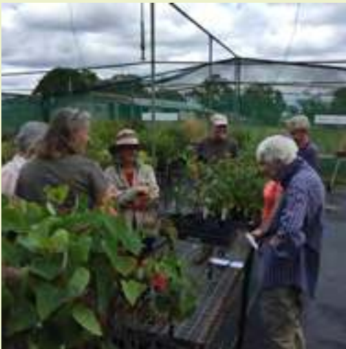
Plant ID training at Porters Lane