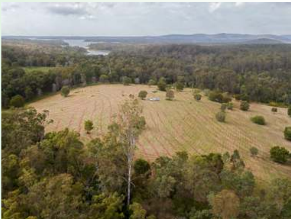
Moreton Bay Regional Council Koala Habitat revegetation works at Whiteside Road Park Samsonvale

Thanks to our hard working BNAS crews for their continued excellent work.