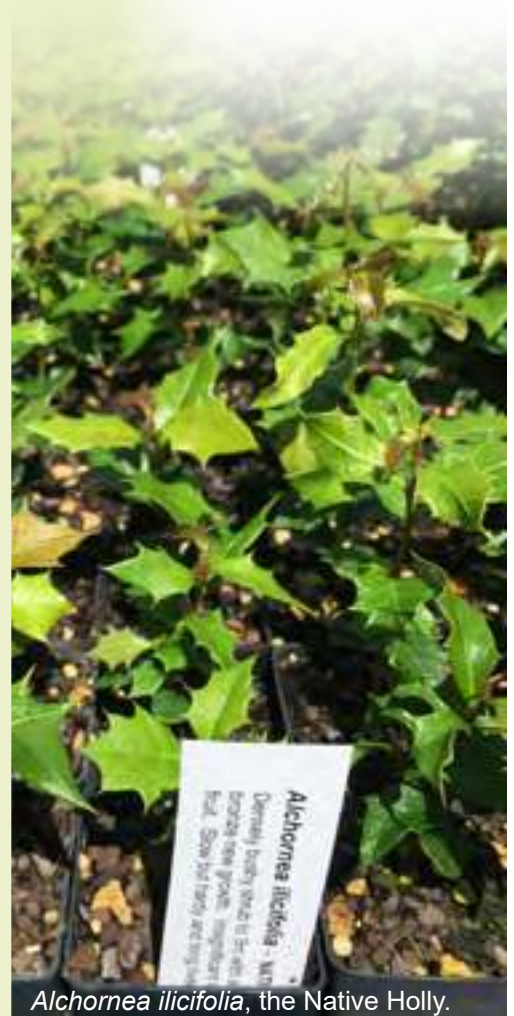
Alchornea ilicifolia , the Native Holly.

But the Native Holly is not so typical, it holds a special place in botanical history as being the first (pollen bearing) species observed to produce fertile seed without pollen (Apomixis). A solitary female specimen collected in Australia and grown in the Kew gardens England produced seed without any male specimens available to her (women insert joke here).